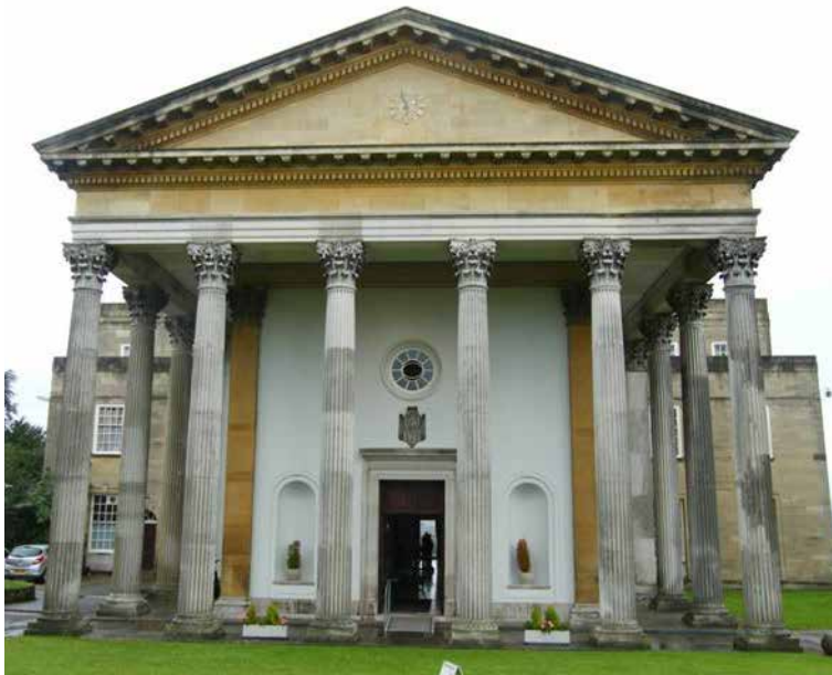
Palladian front of Gatton Hall, now part of the Royal Alexandra and Albert School.